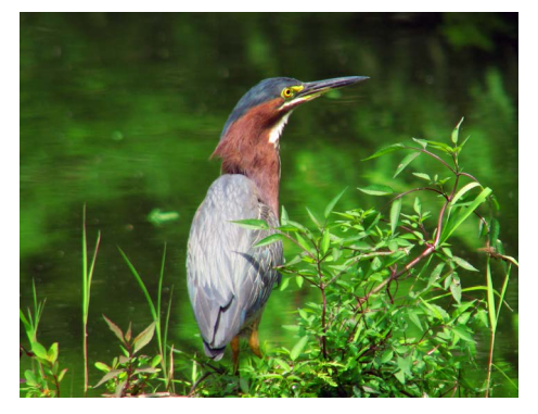
The wildlife refuge would protect wetlands and other habitat for green heron and a variety of diverse species.

The acquisition boundary covers about 577,420 acres. Within this geography, the U.S. Fish and Wildlife Service proposes to acquire up to 40,000 acres through a combination of fee-simple and conservation easement purchases from willing sellers.