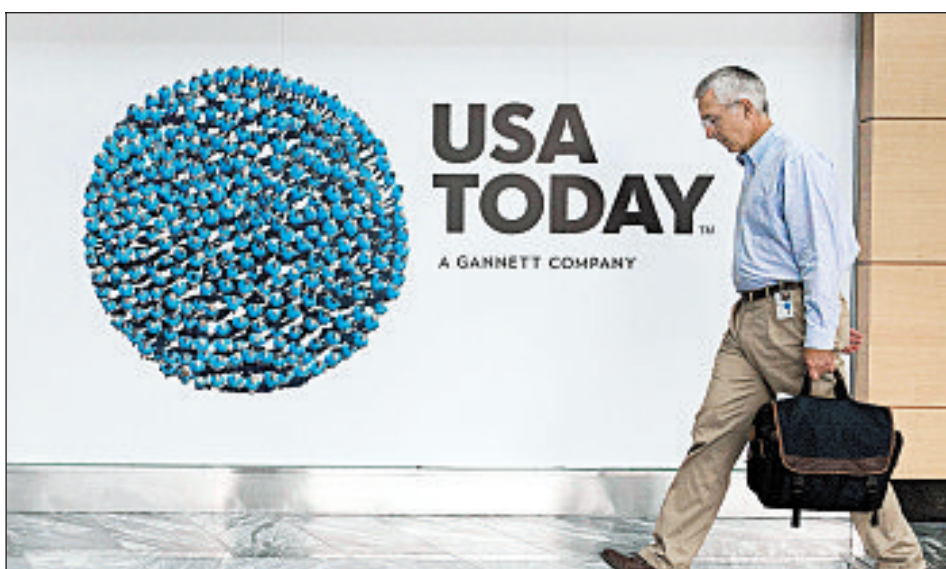
Gannett looks to add to its extensive newspaper portfolio, led by flagship USA Today.

Gannett wants Tribune so that it can grow its USA Today Network, an effort it